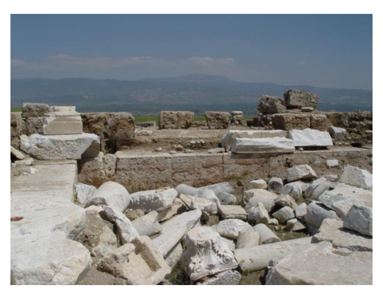
The ruins of Laodicea

The virtual wanton opposition to the highest standards of doctrinal understanding, including the ultimate in restored truths since the passing of the original Apostles, is a rush toward apostasy so rapid, that its degeneration is indeed exponentially faster than previous eras.