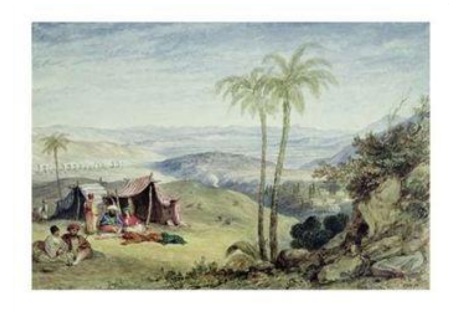
Laodicea, Asia Minor www.baghdadmuseum.org/posters/c64320.html

No limitation is placed upon reproduction of this document except that it must be reproduced in its entirety without modification or deletions. The publisher's name and address, copyright notice and this message must be included. It may be freely distributed but must be distributed without charge to the recipient. Our purpose and desire is to foster Biblical, historical and related studies that strengthen the Church of God's message & mission and provides further support to its traditional doctrinal positions.