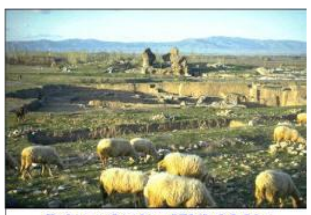
Ruins at the city of Philadelphia

Philadelphia was often wracked by earthquakes with large segments of the population living outside of the city from time-to-time. So severe were the quakes that it came close to utter destruction on several occasions.<sup>2</sup>