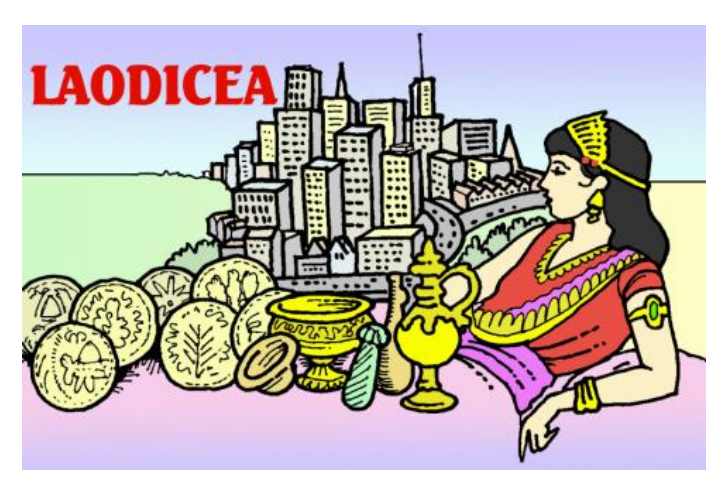
Watering-down and political correctness – attributes of Laodicea

It was also an assize town which would have as a result been fraught with judicial corruption, including weighted decisions and sentences and the proverbial kangaroo court! Thus it was highly politicised.