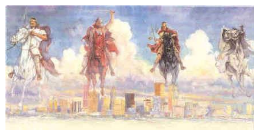
Laodiceans will suffer the Great Tribulation

What a time of tremendous persecution and martyrdom for these people. They will have to give their lives for Christ and His true doctrines, or turn their back on what little of the truth they have kept. Christ will stop their apostatising in its tracks by the Great Tribulation. Should events have continued any longer by, say, just a few years, they would have become utterly Protestant and even have switched to Sunday-observance.