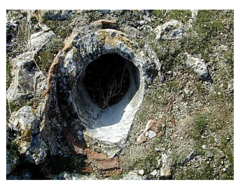
The piped water to Laodicea was lukewarm. It was so rich with calcium that the pipes would block up. So the engineers covered the vents with stones that were removed from time-to-time to permit cleaning.

However, when major impurities did appear from time-to-time, Christ tested them severely through the terrors of tribulation. More on this later.