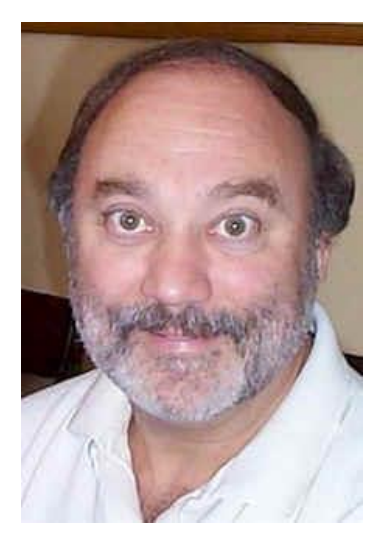
Promoter of apostasy and destroyer of the Philadelphia Era (Rev 3:9)

Laodicea literally means 'judgement of the people' (ie in Tribulation) or 'judgement by the people' (ie the self-righteous ones - the ones who think they are right). How like the Pharisees who were very liberal in doctrine, but oppressive in their administration of justice. They were more like sepulchres daubed with whitewash (see Matt 23:27; Ezek 13:10-15; 22:28. The Heb. for 'daubed' is 'Tuwach', meaning to smear, especially with lime, to overlay or plaster - Strong's # 2902. A related word is 'Tiyach', meaning mortar or plaster - Strong's # 2915).