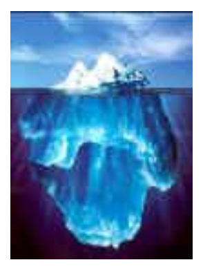
Small changes lead to even more, larger changes. These changes are merely 'the tip of the iceberg'

The insidiousness of Satan and his demons in their infiltration and infections of the doctrinal state of the church is of paramount concern to Christ. The Devil is very clever and far more cunning than any of us. How do his servants operate? Do they make a public announcement of the change in doctrine as soon as it is established? Or do they set up God's people first by withdrawing the old literature, dropping hints and comments ("testing the waters"), make leading announcements, and when they finally decide to make an announcement of the change, it is couched as an answer to a question or as no change at all. The new teaching is offered as mere 'clarification' rather than a 180 degree turn from old understanding. It is presented in such a way as to minimise 'political damage' and to de-emphasise the radical difference between the old and new teaching. In this way the full-blown new doctrine may be gradually introduced later.